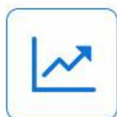
生产效率高 Efficient production