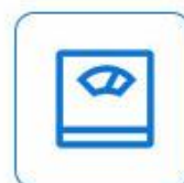
精准称重 Accurate weighing