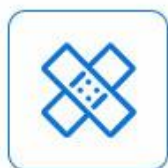
适合各种膏药 Various plasters