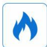
恒定加热 Constant heating