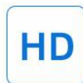
高清人机界面 Operation interface