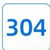
304不锈钢 304 steel