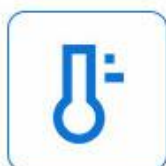
温度检测 Temperature detection